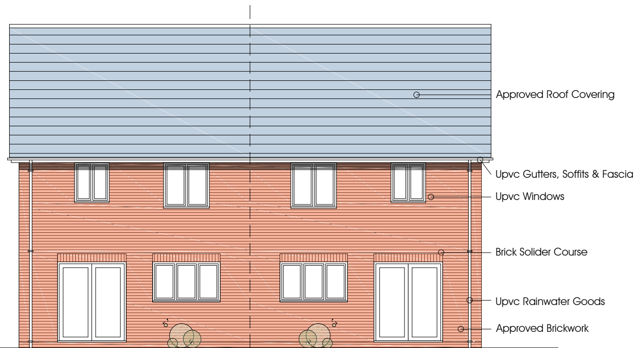
REAR ELEVATION Typical 3 Bed House